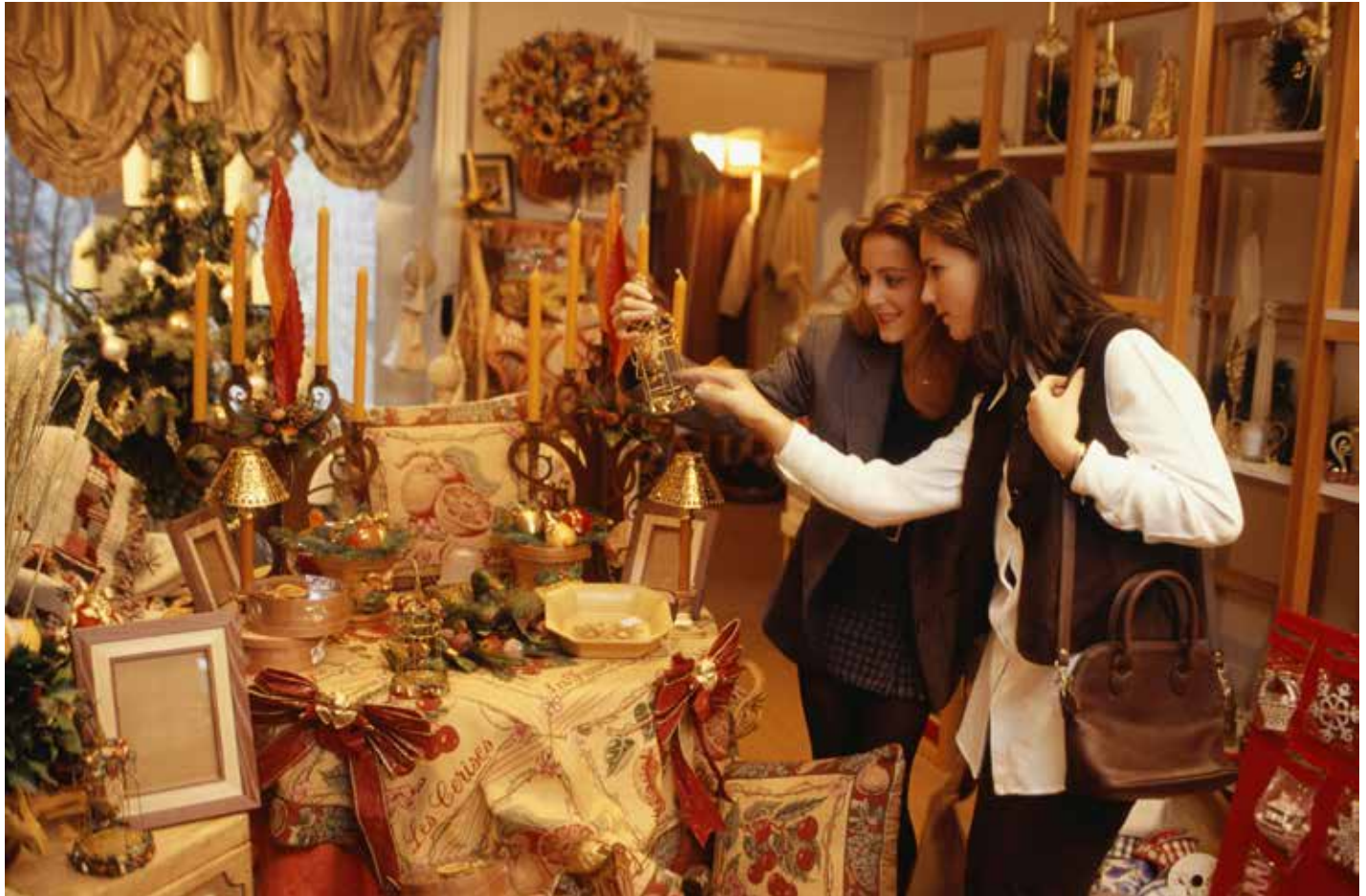
Incredible array of one of a kind treasures on Magazine Street

Miss Smarty Pants, a sophisticated boutique on Magazine's bustling stretch, captivates with its blend of classic and modern women's fashion. This elegant shop, adorned with soft pastels and gleaming mirrors, offers carefully selected dresses, tops, and accessories that exude effortless grace. From silk scarves to structured handbags, each item feels like a discovery,