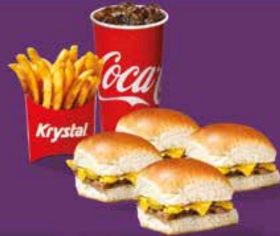
4 KRYSTAL SLIDERS COMBO