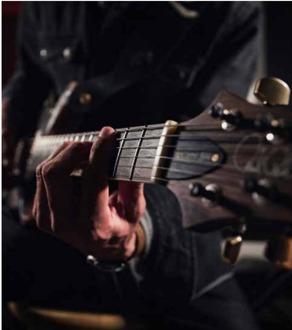
Local and world renowned Blues artists perform nightly

Just down the street in the heart of the Faubourg Marigny, the Spotted Cat Music Club captures the quintessential charm of a classic New Orleans listening room, a cozy, no-frills gem beloved by locals and visitors alike for its nightly lineup of traditional and modern jazz, blues, funk, and more performed by some of the city's finest musicians. With its warm wooden interior, limited seating that encourages closeness to the stage, and a one-drink minimum that keeps the focus on the music, the club creates an intimate, electric environment where every note resonates deeply and the audience sways together in shared appreciation. It remains a local favorite for its