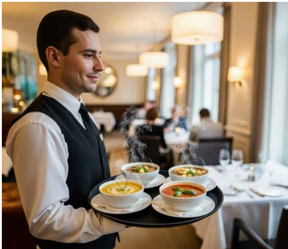
Another New Orleans gourmet experience

On venerable Bourbon Street, Galatoire's preserves the pure essence of old-line Creole dining in an atmosphere of timeless elegance. No reservations are taken for the main dining room, creating that delightful sense of anticipation as guests wait on the sidewalk before being ushered into the bright, mirrored space filled with white tablecloths, jacketed waiters, and the hum of convivial conversation. The menu celebrates classics executed with flawless technique—trout meunière amandine, crabmeat maison, soufflé potatoes—and the wine list offers thoughtful pairings. The experience feels like joining an extended, joyful family celebration where every course arrives with warmth and precision.