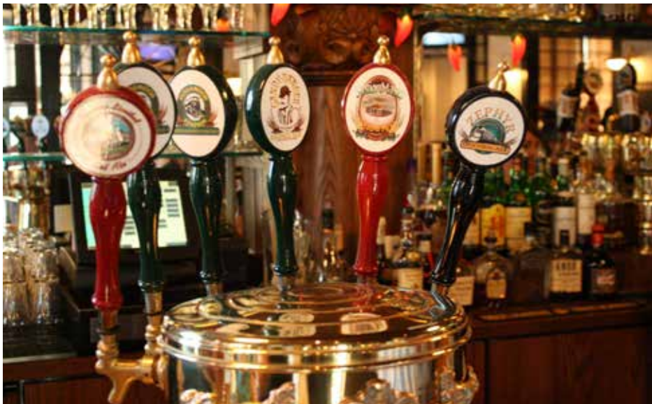
Enjoy one of a kind beers at local brewpubs

These exceptional beer gardens, each possessing its own distinctive personality, beautifully illustrate why New Orleans has emerged as such a compelling destination for those who appreciate fine drinks served in unforgettable settings. They offer far more than a simple pint—they provide windows into our city's generous spirit and love for shared moments under the trees. Whether you are planning a leisurely afternoon with old friends or seeking new connections on your travels, these oases of oak-shaded pleasure await with open arms and perfectly chilled glasses. Come raise a toast beneath our moss-draped canopy; the experience will surely leave you with a deeper appreciation for the many ways New Orleans knows how to celebrate life.