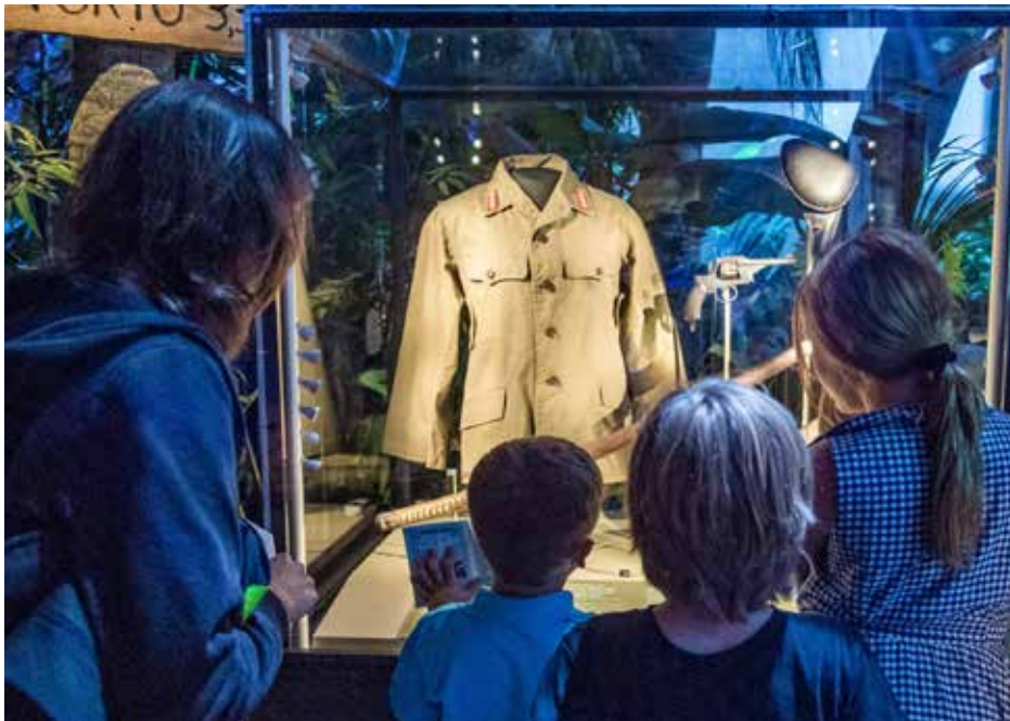
Family captivated by one of the hundreds of intriguing displays at The National WWII Museum

Whether you choose expert guidance or to chart your own course, you'll leave The National WWII Museum with a deeper understanding of the sacrifices and achievements that defined a generation—and a summer experience that is as meaningful as it is unforgettable. Visit nationalww2museum.org/plan-your-visit to learn more.