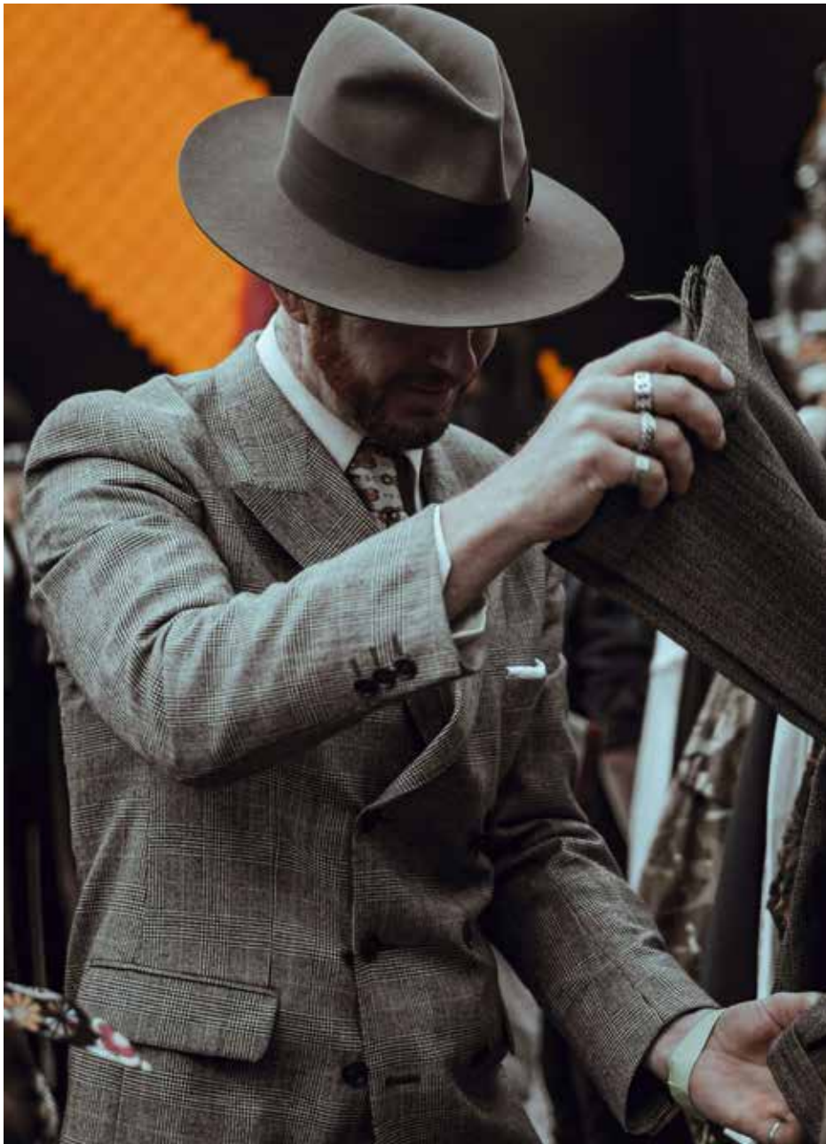
New Orleans offers the finest in men's luxury shopping

In New Orleans, high-end men's fashion shopping transcends mere acquisition—it's a celebration of our city's sartorial soul, where each boutique adds a layer to the narrative of grace and gusto that defines us. From my vantage amid these storied avenues, I assure you that indulging here not only refines your ensemble but deepens your affection for our beguiling metropolis, inviting you to return clad in memories as fine as the fabrics themselves.