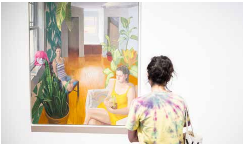
Ogden Museum of Southern Art

Whether your tastes lean classical or cutting-edge, playful or profound, these remarkable institutions collectively paint the fullest picture of why New Orleans continues to enchant the world. They elevate any journey beyond sightseeing into a heartfelt connection with our creative soul, promising memories that linger like the scent of magnolias on a spring evening. So pack your curiosity, step into the ballet of our bayou-inspired canvases, and allow the city's artistic embrace to sweep you away; I promise you will depart not only refreshed but forever changed, already dreaming of your return.