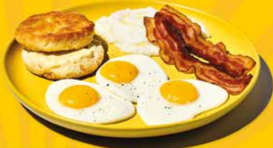
3 EGG BREAKFAST PLATE