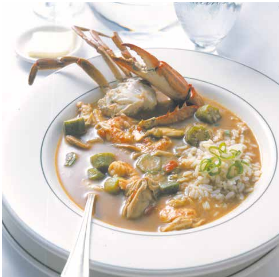
Seafood gumbo at Galatoires

These exceptional establishments, each offering its own distinctive voice within the Creole chorus, beautifully illustrate why New Orleans continues to hold such magnetic appeal for travelers who value extraordinary food served with heart and history. They transform a simple meal into a profound connection with place and people, inviting every guest to linger, savor, and return again and again. Step into these cherished kitchens, allow the aromas to envelop you, and discover firsthand the irresistible charm of a cuisine that has nourished souls and sparked joy for centuries. The table is set, the welcome is warm, and New Orleans awaits with open arms and an appetite for unforgettable moments.